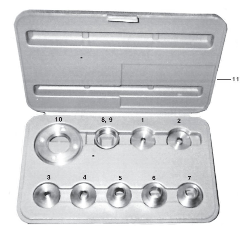
NOTE: Some parts are listed and shown for illustration purposes only, and are not available individually as replacement parts.